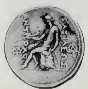
Lot No. 2136

Antiochos II, 261-246 B.C. Tetradrachm, 261-256 B.C. Seleucia on the Tigris. Diademed head r. of Antiochos I. Rv. Apollo seated l. on omphalos. 16.923 grams. ESM 178. Very Fine. (400-500)